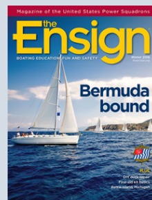
Ensign - Winter 2016